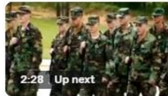
Brothers at War | movie | 2009 | Official Trailer